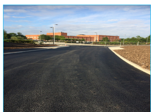
Access Road Works