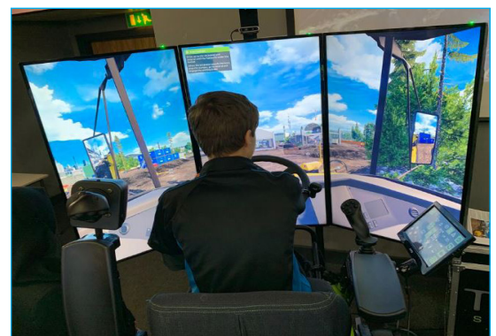
Plant (25t dumper) Machine Simulator