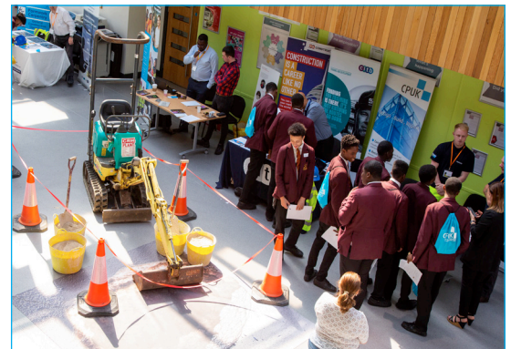
Careers Fair & Student Engagement