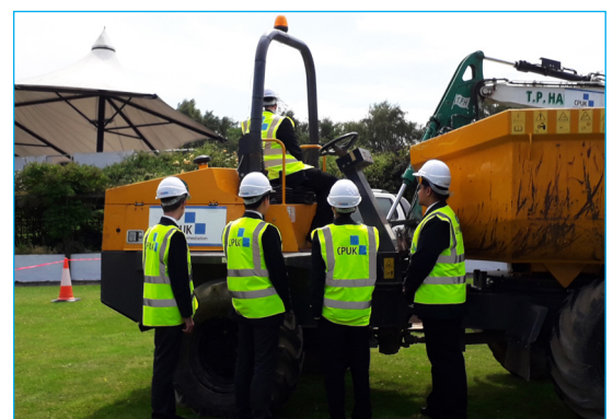
Plant Introduction & Traffic Management

Our Next Events: Liverpool in December 2019, Warrington in March 2020 and back at Manchester Openshaw in 2020